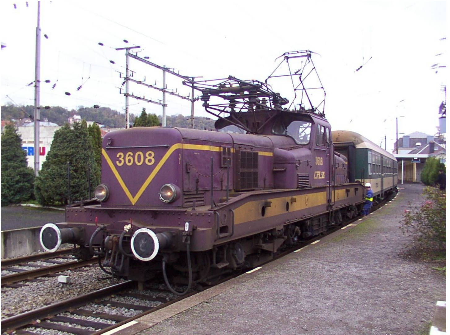
3608 at Longwy about to run round a rake of Wegmann stock.