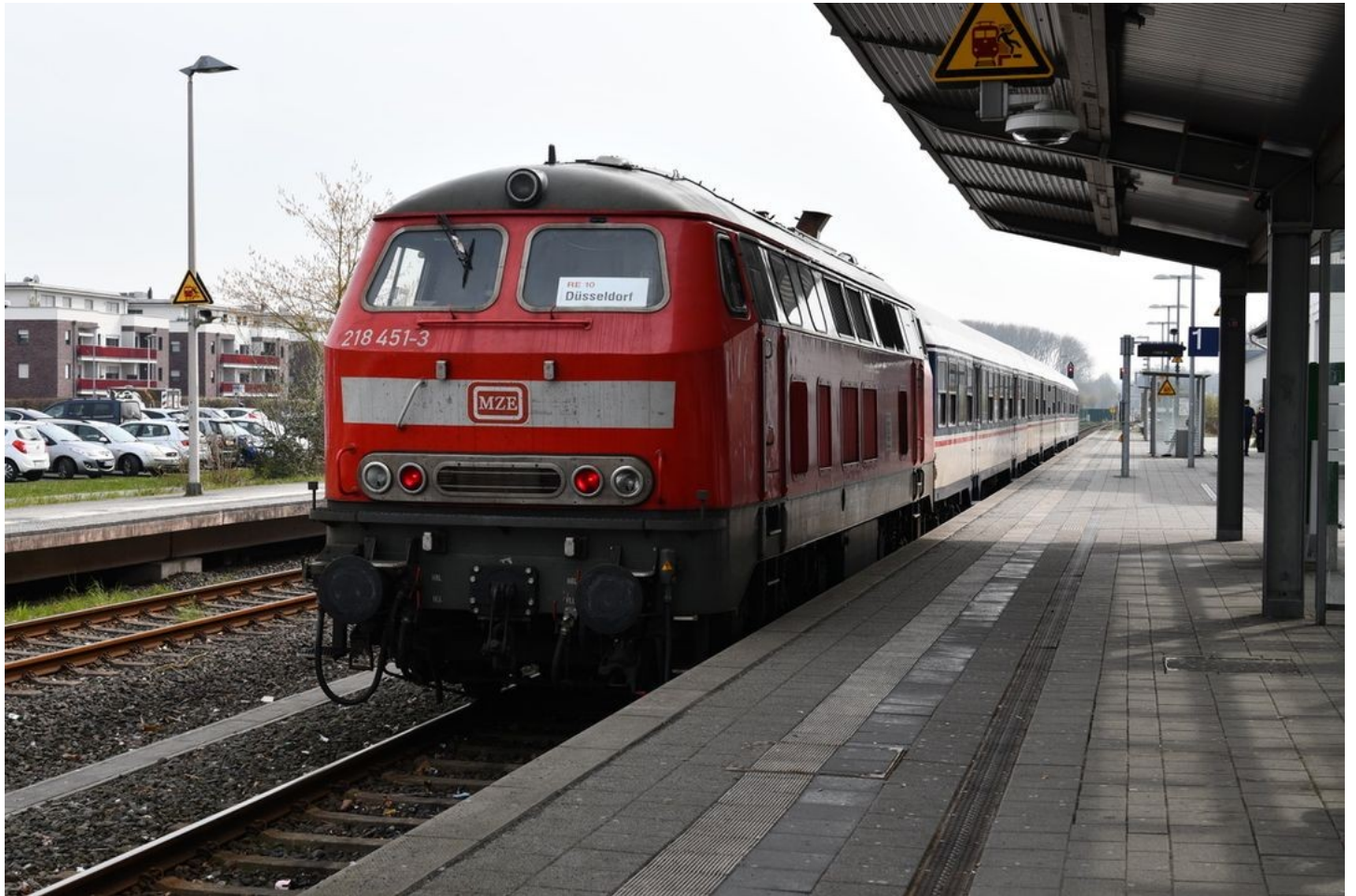
At Krefeld on it's way to Düsseldorf Hbf