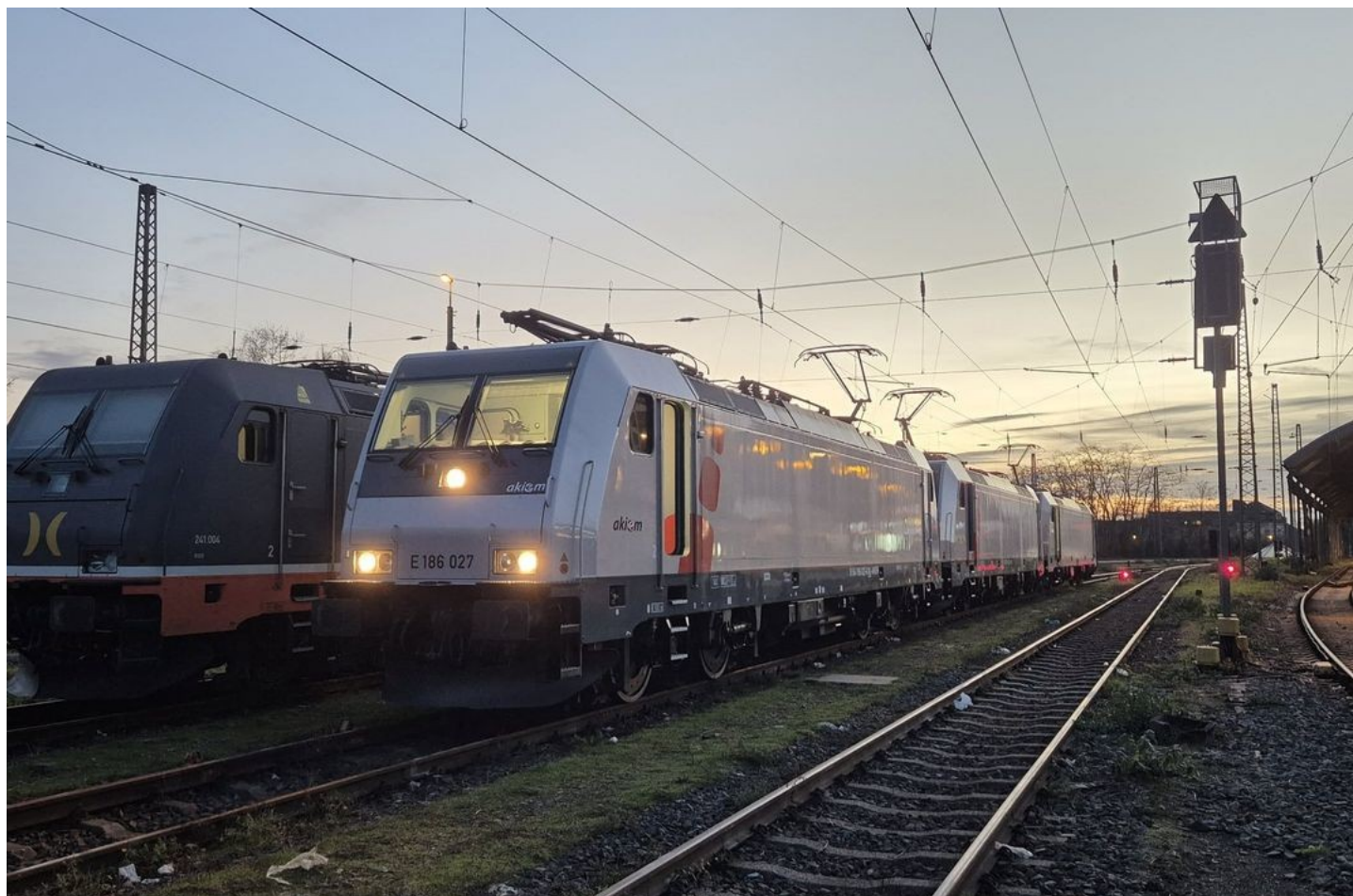
Passage of the train near Tostedt on 19 December 2025.