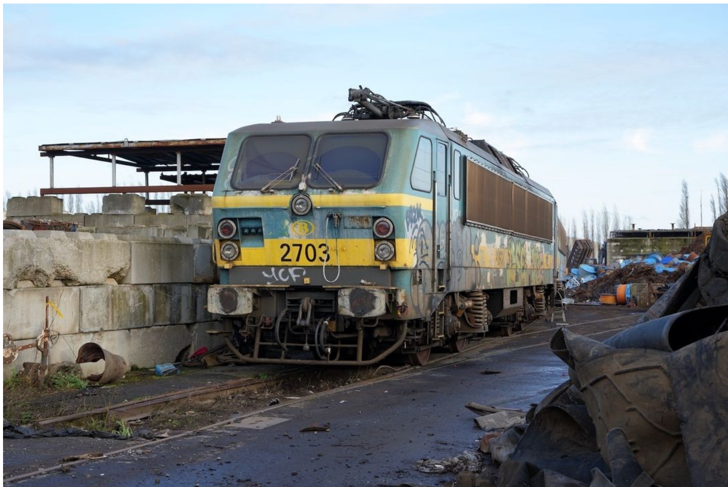
2703 and 2710 at Casier Deerlijk on 18th December 2025.