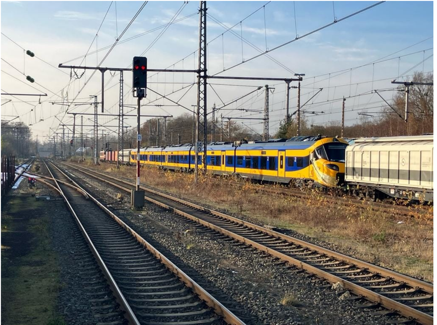
and taken at Bentheim Spa on Sunday 3rd December 2023 in some nice autumn sun. “Kijk wat de ooievaar bracht, dat stond in de glazen bol. Look what the Stork brought, it was in my Glass Ball. The 3141”